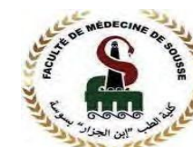
Faculty of Medicine Ibn Al-Jazzar